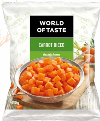
Carrot diced 450 g