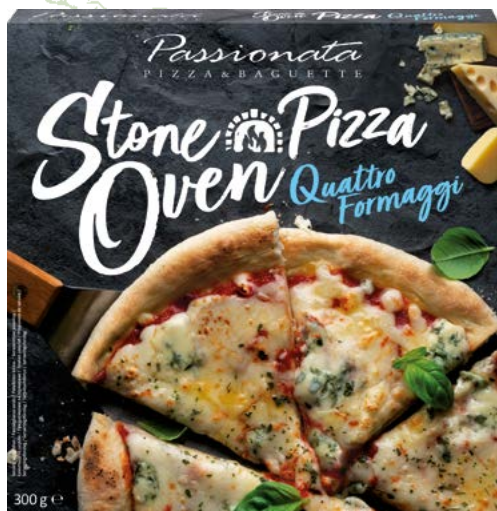
Pizza Quattro Formaggi 300 g