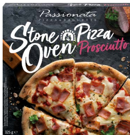
Pizza Prosciutto 320 g