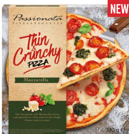
Pizza Mozzarella 320 g