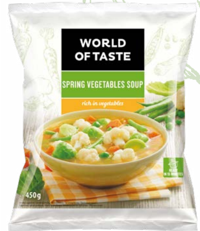
Spring vegetables soup 450 g

Ingredients: carrot, parsley, celery, leek.