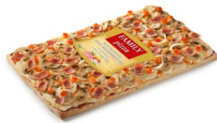
Pizza with ham and mushroom 1 kg