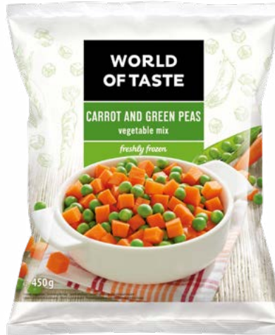
Carrot and green peas vegetable mix 450 g

Ingredients: carrot, cauliflower, green cut bean, green peas, leek, celery, parsley.