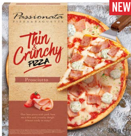
Pizza Prosciutto 320 g