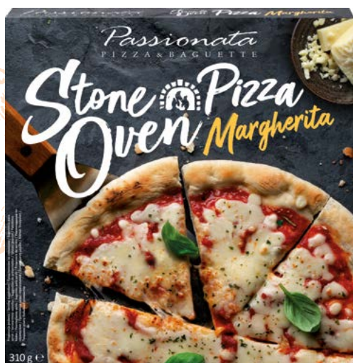
Pizza Margherita 310 g