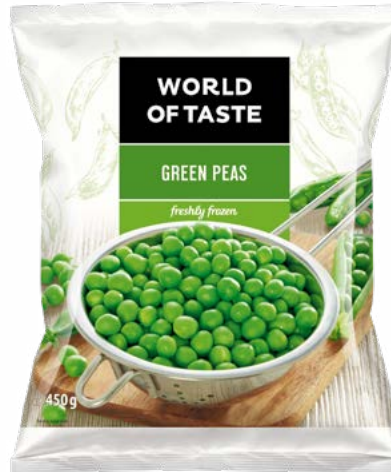
Green peas 450 g