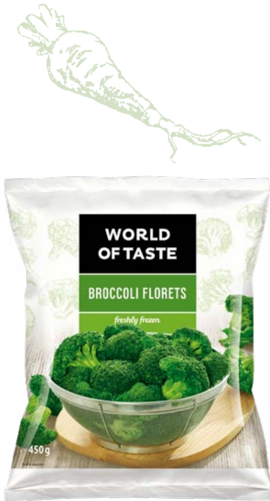
Broccoli florets 450 g