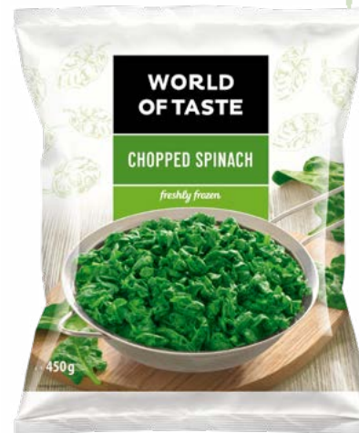
Chopped spinach 450 g