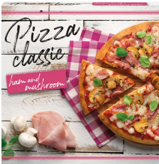
Pizza ham & mushroom 300 g