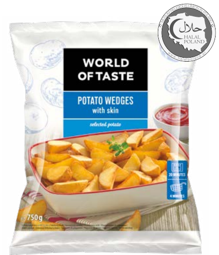
Potato wedges with skin 750 g