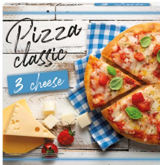
Pizza 3 cheese 300 g