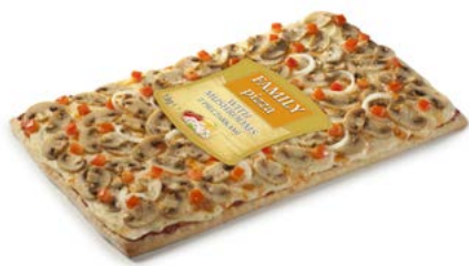
Pizza with mushrooms 1 kg