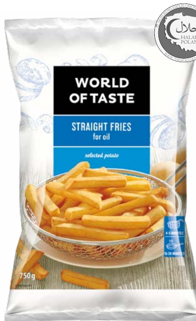
Straight fries for deep-frying 750 g, 1 kg