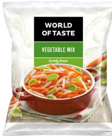
Vegetable mix 450 g

Ingredients: carrot, broccoli, cauliflower.