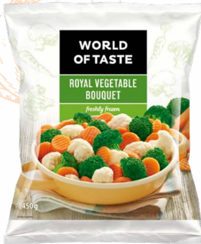
Royal vegetable bouquet 450 g

Ingredients: carrot, Mung bean sprouts, Mun mushroom, bamboo shoots, courgette, red bell pepper, leek, onion.