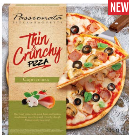
Pizza Capricciosa 335 g