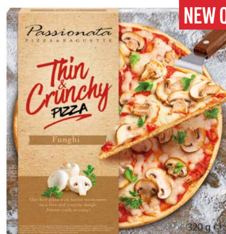
Pizza Funghi 320 g