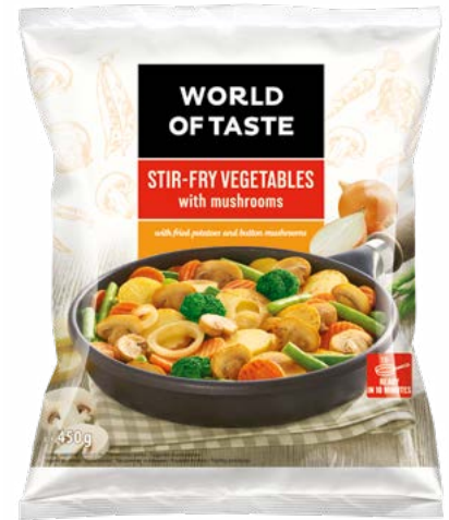
Stir-fry vegetables with mushrooms 450 g

Ingredients: broccoli, carrot, onion, green cut bean, corn, green bell pepper, red bell pepper, courgette, pre-fries onion slices.