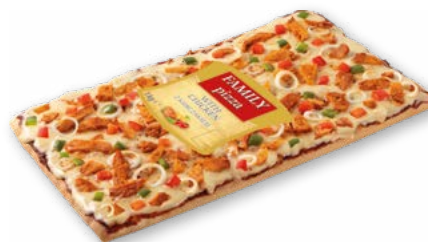
Pizza with chicken 1 kg