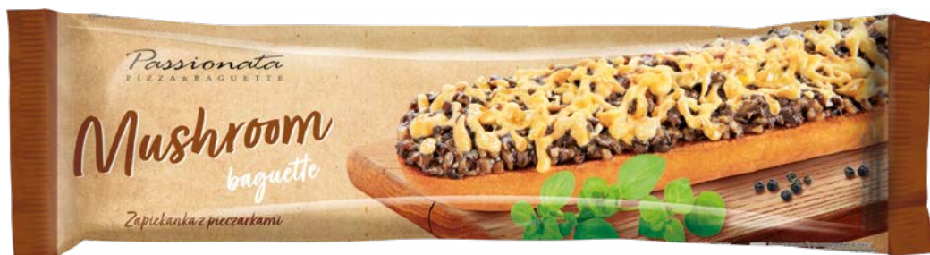
Mushroom baguette 200 g