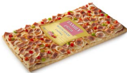
Pizza with ham 1 kg