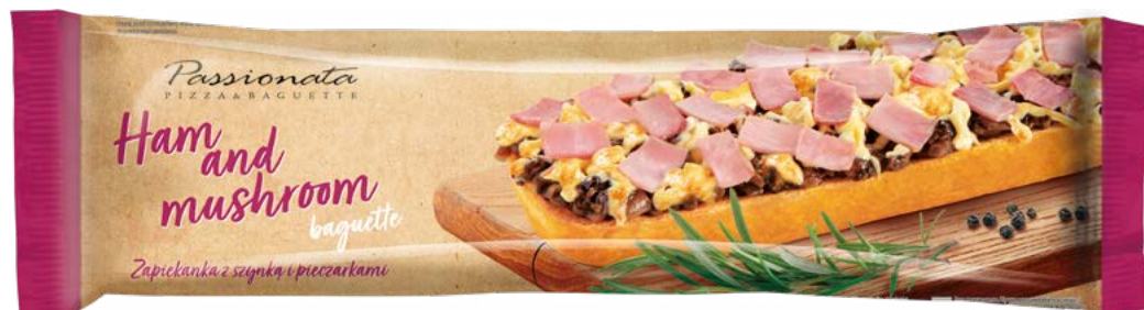
Ham and mushroom baguette 200 g