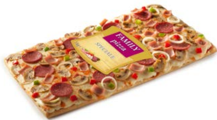
Pizza speciale 1 kg