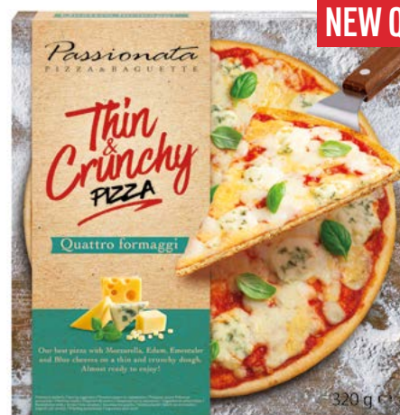
Pizza Quattro Formaggi 320 g