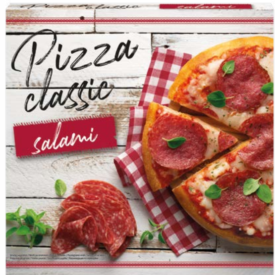
Pizza salami 280 g