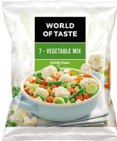
7-vegetable mix 450 g

Ingredients: carrot, cauliflower, green cut bean, green peas, leek, celery, parsley.