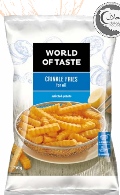
Crinkle fries for deep-frying 750 g