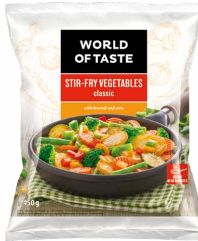
Stir-fry vegetables classic with broccoli and corn 450 g

Ingredients: broccoli, carrot, green flat bean, corn, red bell pepper, courgette, herb spice.