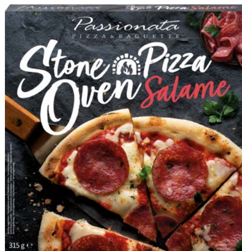
Pizza Salame 330 g