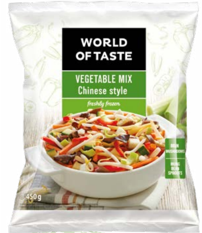
Vegetable mix Chinese style 450 g

Ingredients: carrot, Mung bean sprouts, Mun mushroom, bamboo shoots, courgette, red bell pepper, leek, onion.