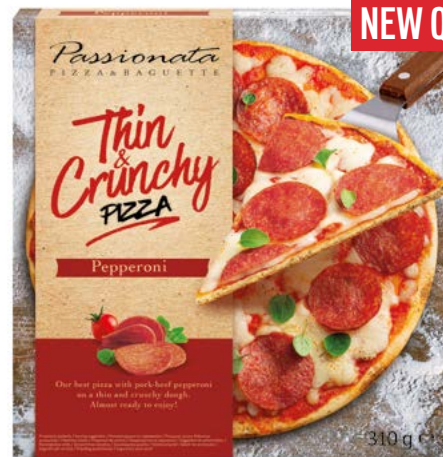
Pizza Pepperoni 310 g