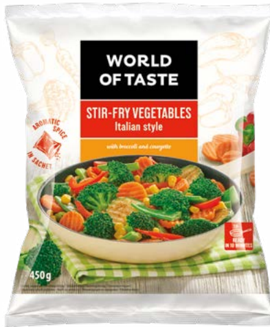
Stir-fry vegetables Italian style with broccoli and courgette 450 g

Ingredients: broccoli, carrot, green flat bean, corn, red bell pepper, courgette, herb spice.