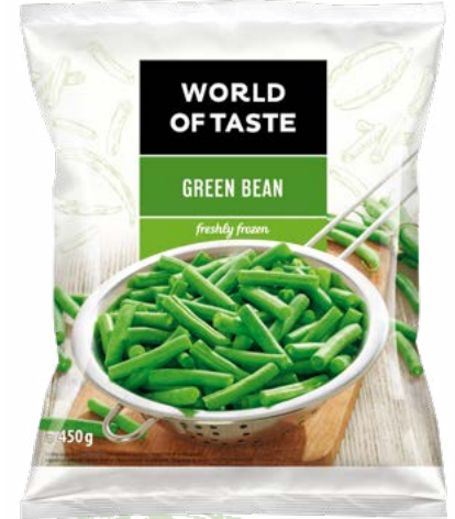
Green bean 450 g