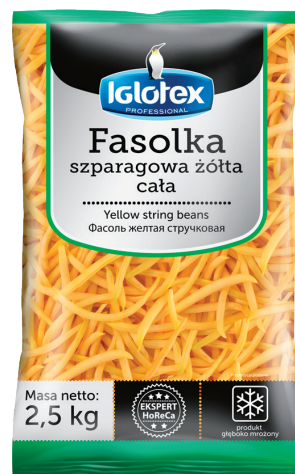
Yellow string beans

net weight 2,5 kg EAN 5 902 162 363 212 pieces in box 4 pieces on layer 36 Ingredients: green string beans