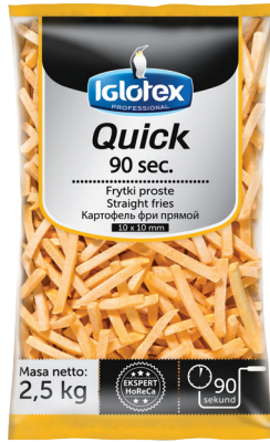
Quick 90 sec. straight fries 10x10

net weight 2,5 kg EAN 5 902 162 362 116 pieces in box 5 pieces on layer 45