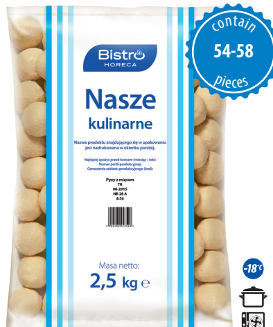
Sweet dumplings with strawberries

net weight 2,5 kg EAN 5 902 162 253 520 pieces in box 4 pieces on layer 36