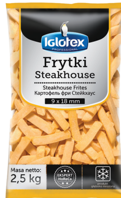
Steakhouse fries 9x18

net weight 2,5 kg EAN 5 902 162 362 314 pieces in box 5 pieces on layer 45