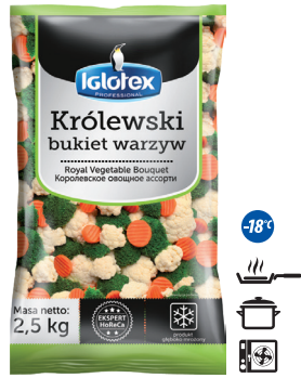
Royal vegetable bouquet

net weight 2,5 kg EAN 5 902 162 364 219 pieces in box 4 pieces on layer 36 Ingredients: broccoli florets, cauliflower florets, carrots