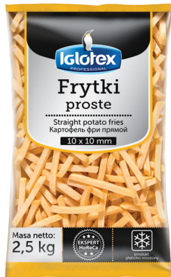
Straight fries 10x10

net weight 2,5 kg EAN 5 902 162 362 413 pieces in box 4 pieces on layer 36