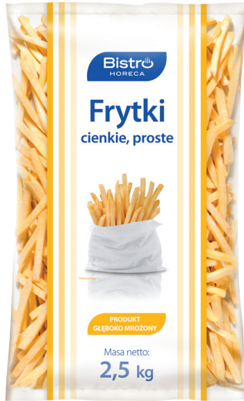
Thin straight fries 8x8

net weight 2,5 kg EAN 5 902 162 367 418 pieces in box 5 pieces on layer 45