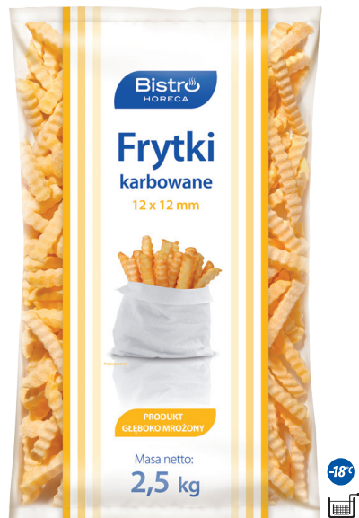
Crinkle fries 12x12

net weight 2,5 kg EAN 5 902 162 367 319 pieces in box 5 pieces on layer 45