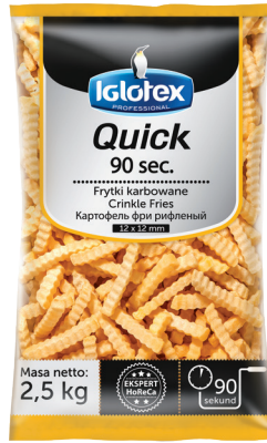
Quick 90 sec. crinkle fries 12x12

net weight 2,5 kg EAN 5 902 162 362 116 pieces in box 5 pieces on layer 45