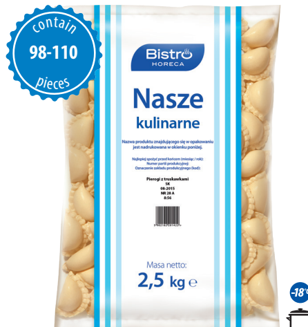
Dumplings filled with strawberries

net weight 2,5 kg EAN 5 902 162 209 923 pieces in box 4 pieces on layer 36