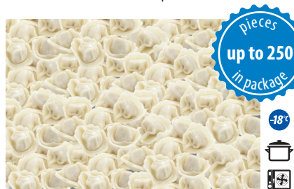
Tortellini with sauerkraut and mushroom

net weight 10 kg (4x2,5 kg) EAN 5 902 162 251 823 carton boxes on layer 9 carton boxes on pallet 72