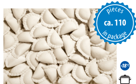
Dumplings filled with meat

net weight 10 kg (4x2,5 kg) EAN 5 902 162 216 020 carton boxes on layer 9 carton boxes on pallet 72