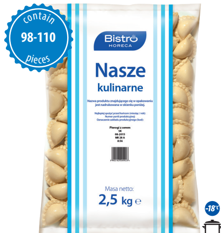
Dumplings filled with cheese

net weight 2,5 kg EAN 5 902 162 212 923 pieces in box 4 pieces on layer 36