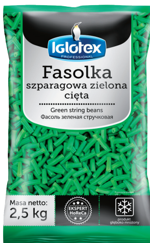
Green string beans (cut)

net weight 2,5 kg EAN 5 902 162 363 113 pieces in box 4 pieces on layer 24 Ingredients: broccoli florets