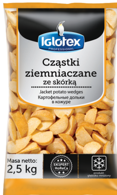
Jacket potato wedges

net weight 2,5 kg EAN 5 902 162 362 611 pieces in box 5 pieces on layer 45