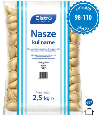
Dumplings filled with meat

net weight 2,5 kg EAN 5 902 162 217 225 pieces in box 4 pieces on layer 36