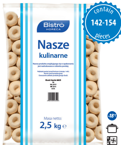
Silesian dumplings MAXI

net weight 2,5 kg EAN 5 902 162 276 420 pieces in box 4 pieces on layer 36