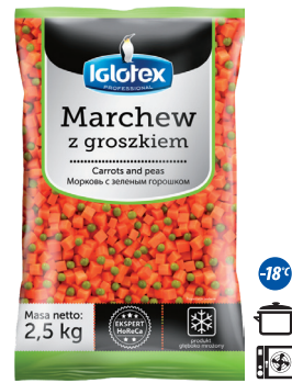
Carrots and peas

net weight 2,5 kg EAN 5 902 162 364 219 pieces in box 4 pieces on layer 36 Ingredients: broccoli florets, cauliflower florets, carrots