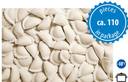
Dumplings filled with potatoes and curd cheese

net weight 10 kg (4x2,5 kg) EAN 5 902 162 214 620 carton boxes on layer 9 carton boxes on pallet 72