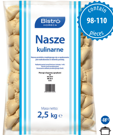
Dumplings filled with sauerkraut and mushrooms

net weight 2,5 kg EAN 5 902 162 213 029 pieces in box 4 pieces on layer 36