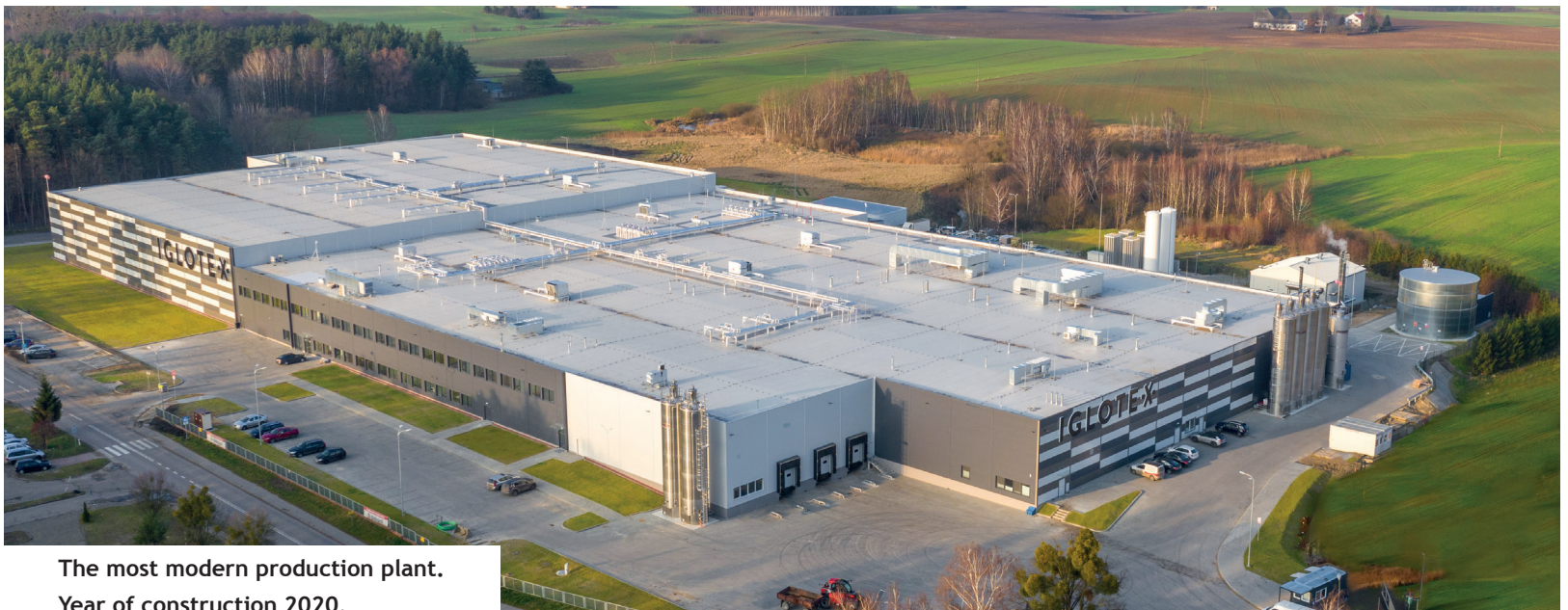
The most modern production plant. Year of construction 2020.

The quality and the taste of Iglotex products have won the recognition of customers from several dozen countries in Europe and around the World!