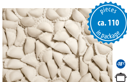
Dumplings filled with sauerkraut and mushrooms

net weight 10 kg (4x2,5 kg) EAN 5 902 162 214 620 carton boxes on layer 9 carton boxes on pallet 72