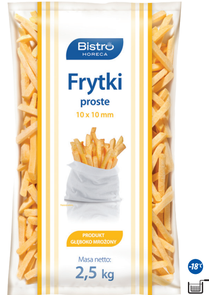
Straight fries 10x10

net weight 2,5 kg EAN 5 902 162 367 418 pieces in box 5 pieces on layer 45