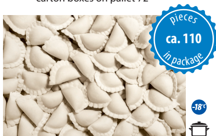
Dumplings filled with cheese

net weight 10 kg (4x2,5 kg) EAN 5 902 162 219 922 carton boxes on layer 9 carton boxes on pallet 72