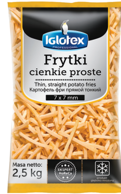
Thin straight fries 7x7

net weight 2,5 kg EAN 5 902 162 362 215 pieces in box 5 pieces on layer 45