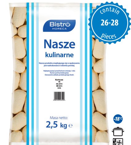
Zeppelins with meat

net weight 2,5 kg EAN 5 902 162 008 205 pieces in box 4 pieces on layer 36