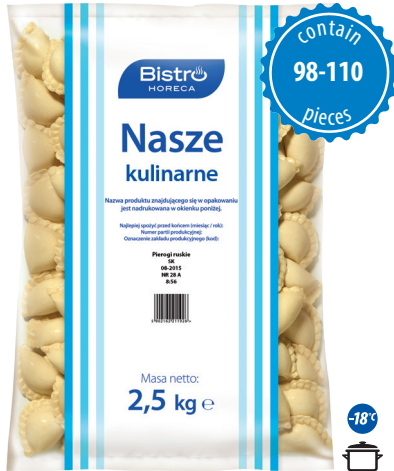
Dumplings filled with potatoes and curd cheese

net weight 2,5 kg EAN 5 902 162 213 029 pieces in box 4 pieces on layer 36