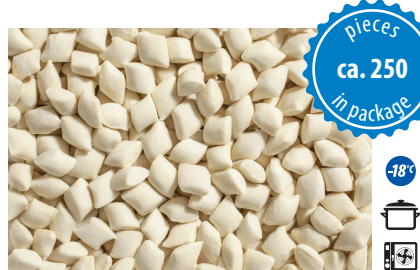
Gnocchi type dumplings

net weight 10 kg (4x2,5 kg) EAN 5 902 162 221 024 carton boxes on layer 9 carton boxes on pallet 72