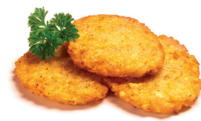
Country style Potato pancakes

net weight 2,5 kg EAN 5 902 162 362 710 pieces in box 5 pieces on layer 45