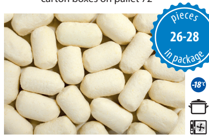
„Zeppelins„ Potato dumplings filled with meat

net weight 10 kg (4x2,5 kg) EAN 5 902 162 200 227 carton boxes on layer 9 carton boxes on pallet 72