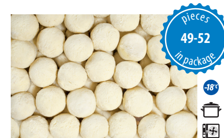
Potato dumplings with meat

net weight 10 kg (4x2,5 kg) EAN 5 902 162 286 122 carton boxes on layer 9 carton boxes on pallet 72