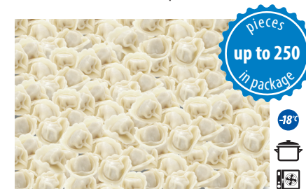
Tortellini with meat

net weight 1 kg EAN 5 902 162 282 025 carton boxes on layer 10 carton boxes on pallet 70