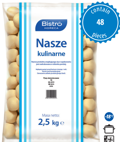
Potato dumplings with meat

net weight 2,5 kg EAN 5 902 162 272 620 pieces in box 4 pieces on layer 36