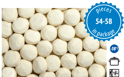
Dumplings with strawberries

net weight 10 kg (4x2,5 kg) EAN 5 902 162 276 727 carton boxes on layer 9 carton boxes on pallet 72